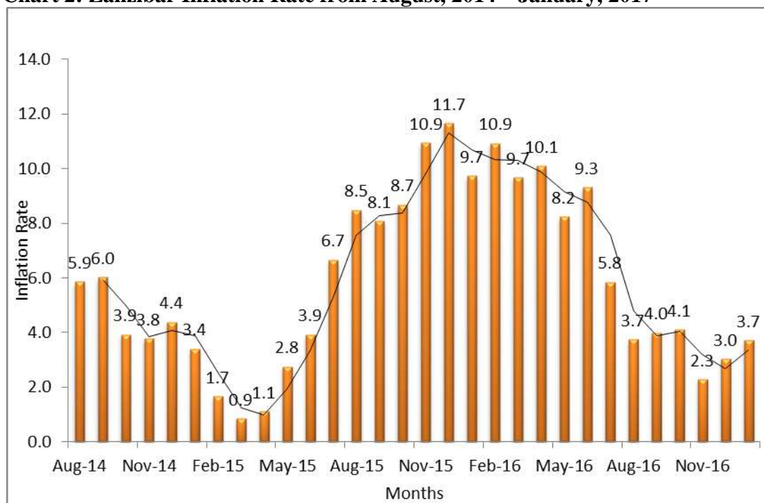
Chart 2: Zanzibar Inflation Rate from August, 2014 – January, 2017