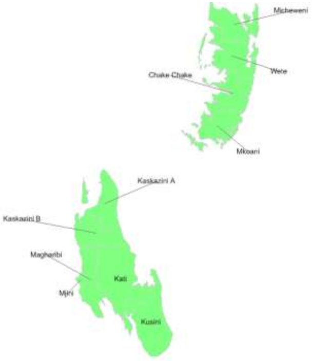
Figure 1.1: Map of Zanzibar showing District Boundaries