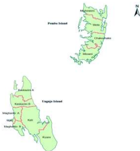
Figure 1.1: Map of Zanzibar showing District Boundaries